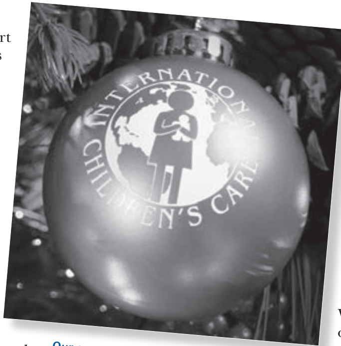
Our 2012 Christmas Ornament