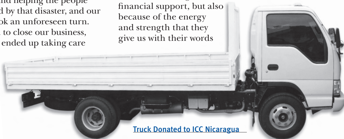
Truck Donated to ICC Nicaragua