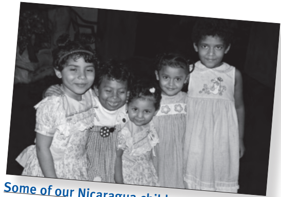
Some of our Nicaragua children