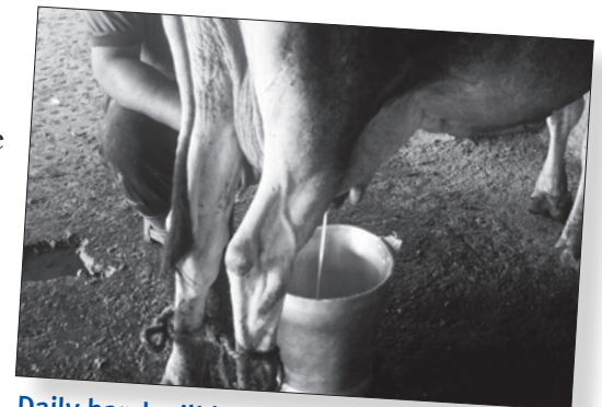
Daily hand milking

We continue to depend upon our faithful ICC family of supporters to continue the legacy of giving. The summer months are especially difficult, and we value your generosity at this time. May God, who is the giver of every perfect gift, give you His continued blessing as you faithfully give of yourself in support of "His Kids."