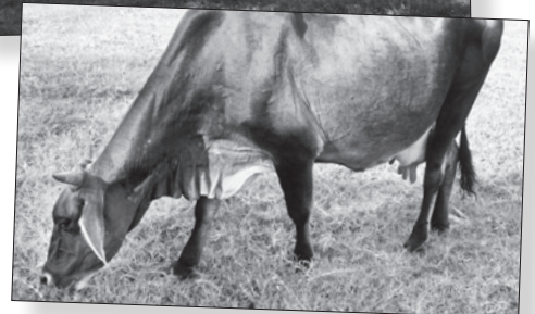
dairy building & one of our dairy cows

During all these years God has blessed us with many special people like these Dutch people that they could get to know about this project, and He has placed in their hearts the desire to help. This spirit of unconditional love, expecting nothing in return, inspires us and gives us new strength to continue on.