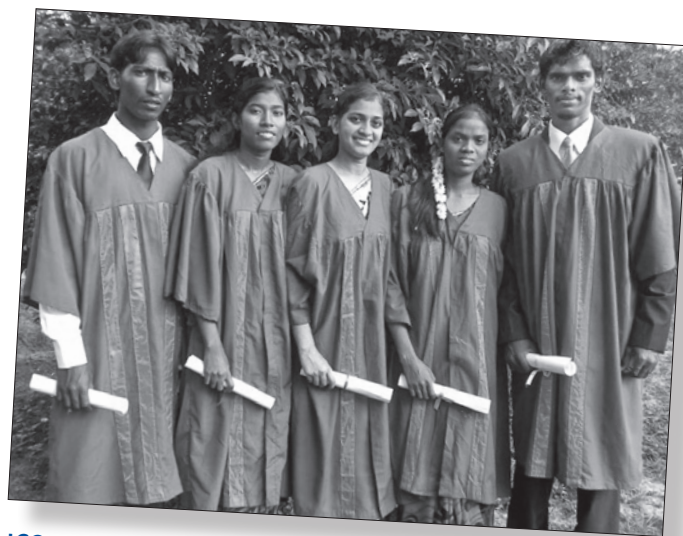
ICC graduating students from India

We urgently need more sponsors and donors right now. This is a very difficult economic time for individuals and organizations. If you can help us find others who have a heart for children like you do, we will be happy to send them information about this ministry that God set up to help children around the world.