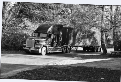
The Container leaves Vancouver