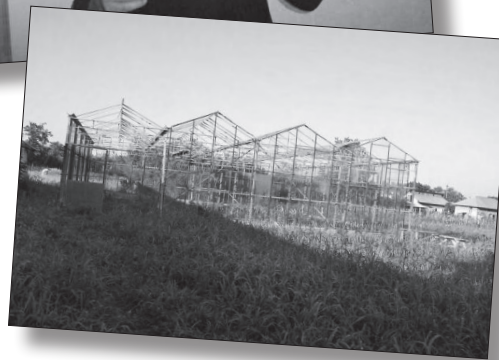
Certificate for installing heat systems _____ and our green houses _____

BFK Bakery have already been raised. The construction of the bakery will be done by BFK Construction.