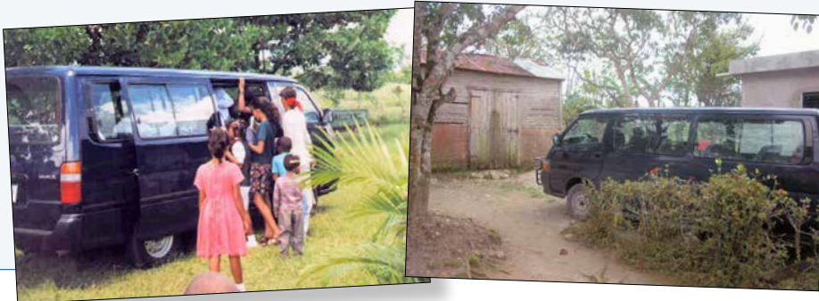
The van in it's heyday

If you would like to take advantage of this generous offer and double your donation, please send your gift to ICC marked "Dominican Van Fund" to our address: PO Box 820610, Vancouver, WA. 98682-0013. If you would like to donate by credit card you can reach us at 800.422.7729 and be sure to mention that your contribution is for the Dominican Van. Our children at Las Palmas appreciate any help you can provide for them. And as always, thanks for all you do for "His Kids."