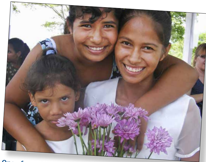
One of our older children comes home to visit

Words like that tell us what makes the difference in the ICC homes around the world. The kids as they grow up aren't embarrassed to say where they grew up, because our homes are not orphanages. From when a boy or girl comes, they are no longer an orphan and they become part of a family where they care for them and love them. So when they grow up and leave, they always come back to visit, thinking